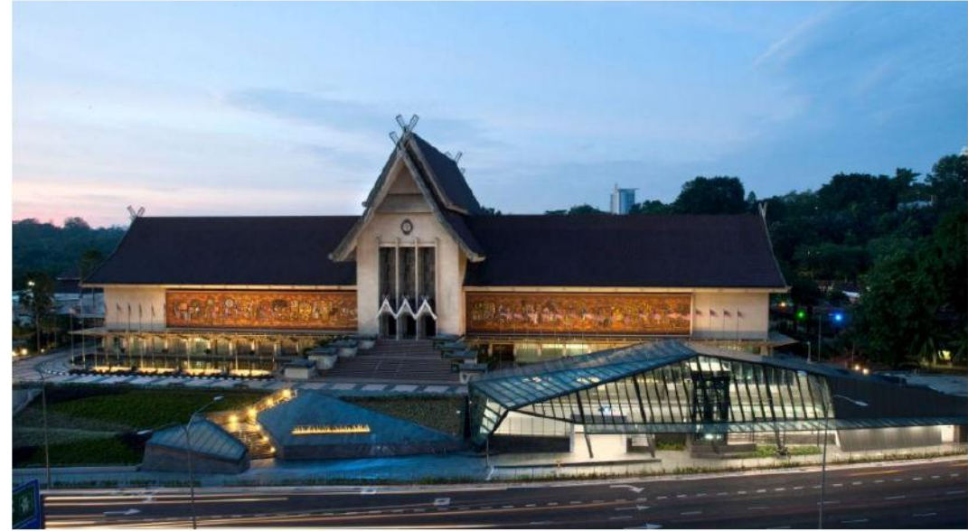
Pasar Seni MRT Station Kuala Lumpur Malaysia