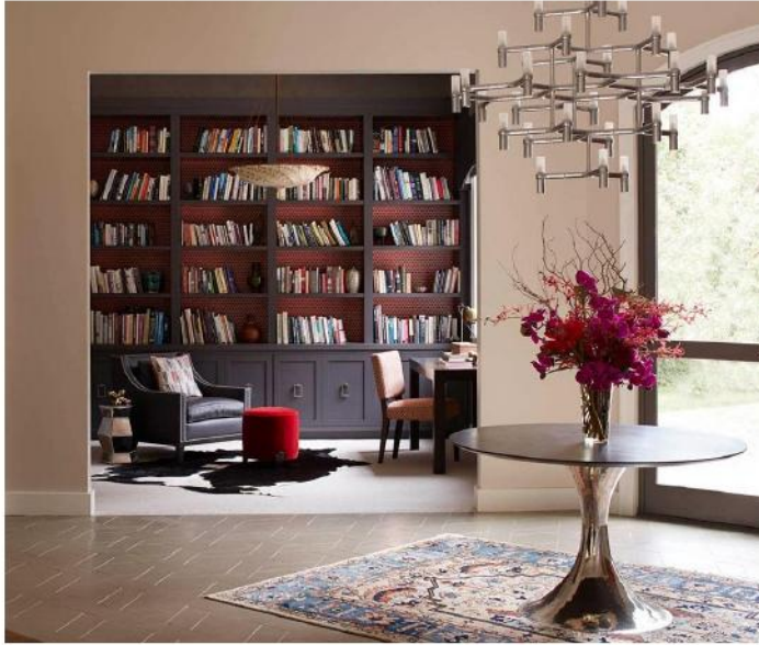
Villa Sielen Diva Talpe Sri Lanka