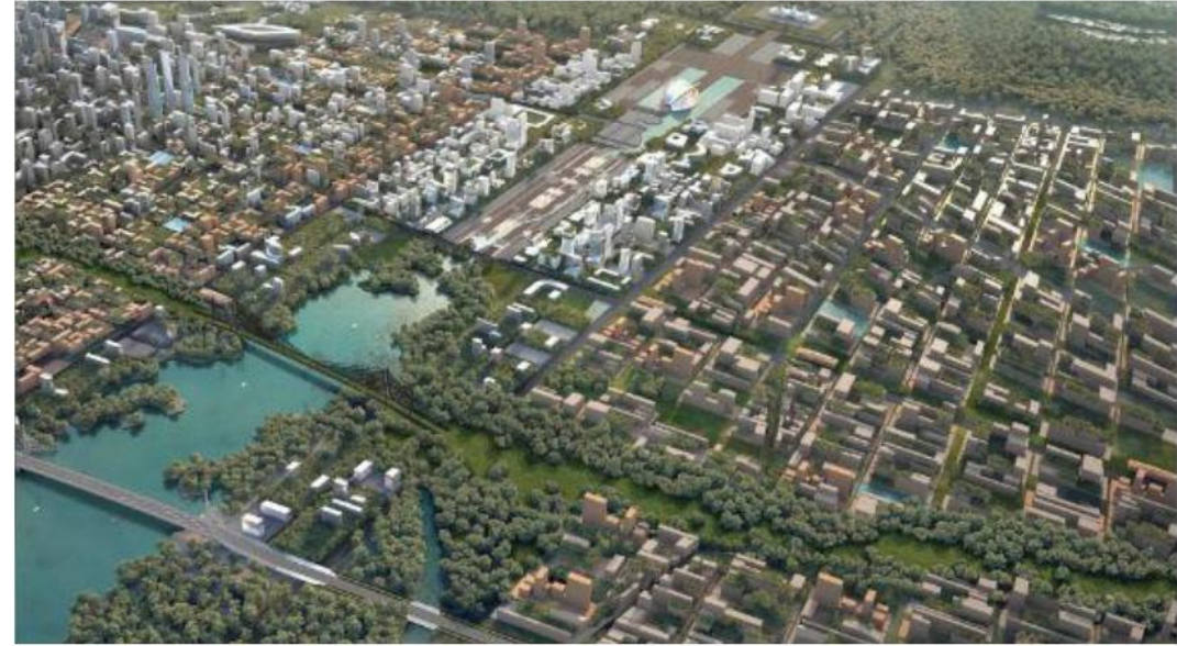
Kawasan Retail Container Abdul Muis Jakarta Indonesia