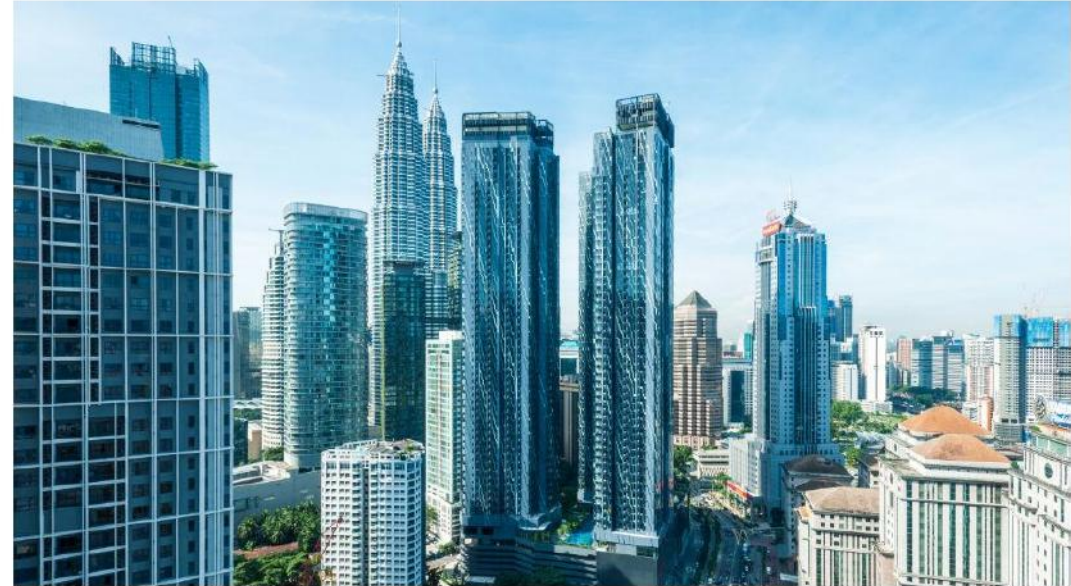
Oxley Towers Kuala Lumpur Malaysia