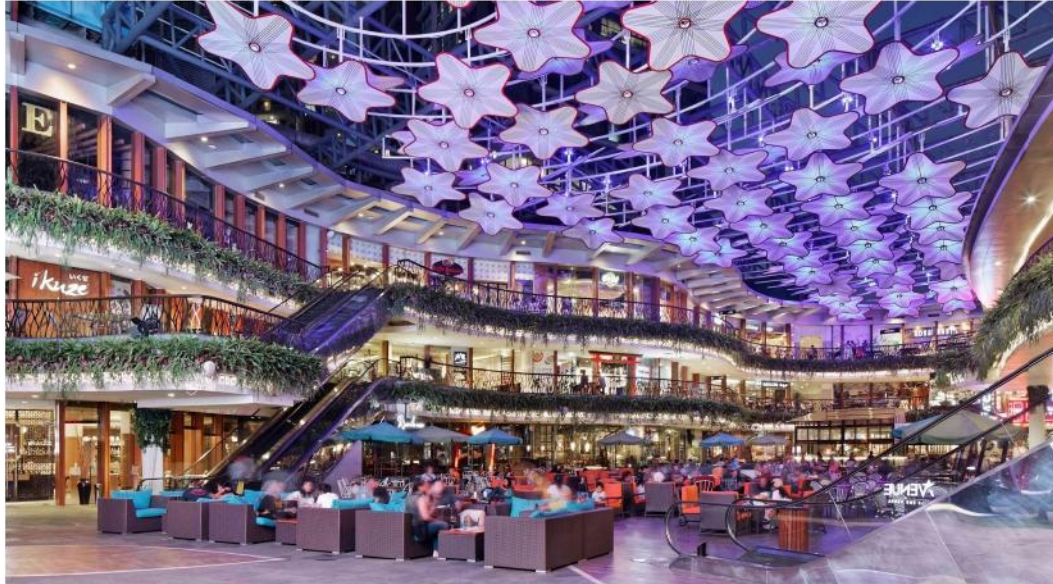
Avenue of the Stars Lippo Mall Kemang Jakarta Indonesia