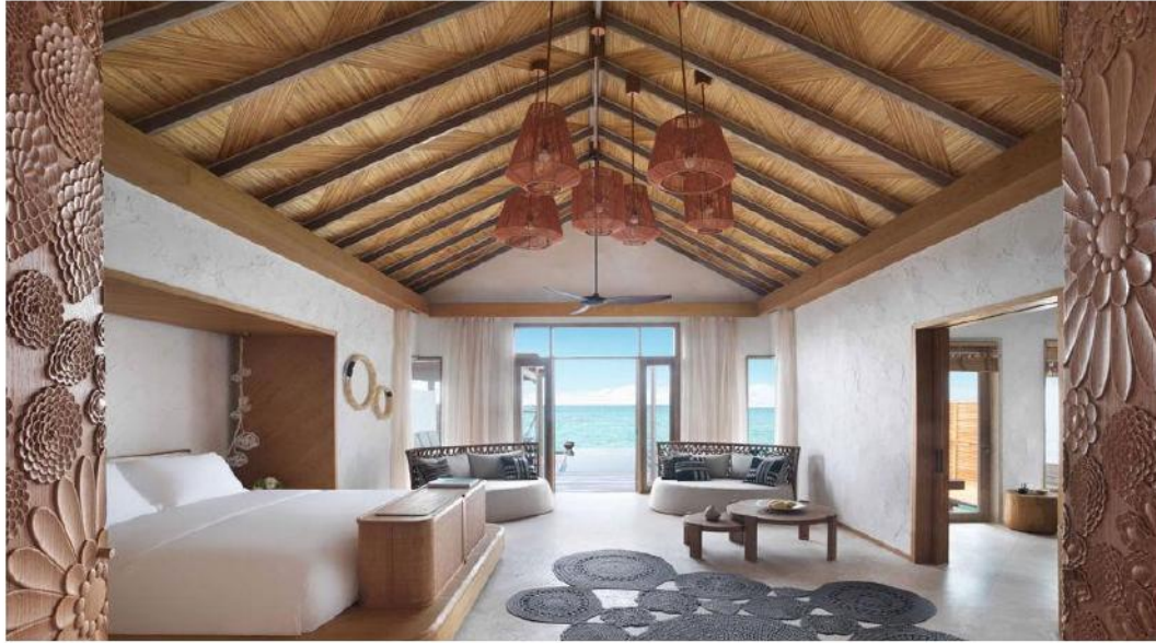
Yello Hotel Jl. Gunung Sahari Jakarta Indonesia