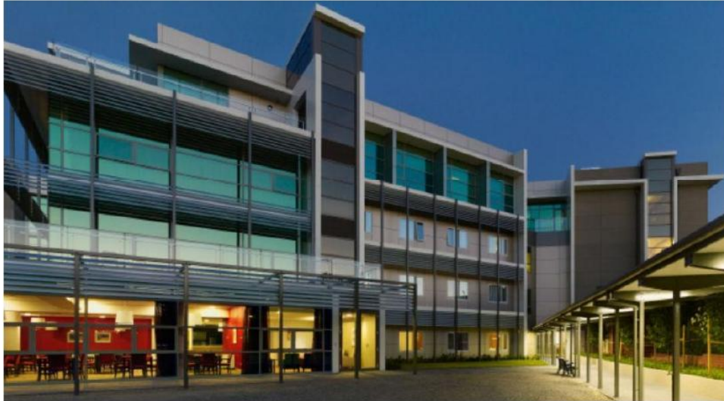
Coppin Suites Melbourne Australia