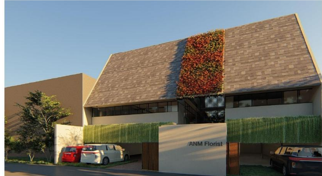
DK Residence Almere Netherlands