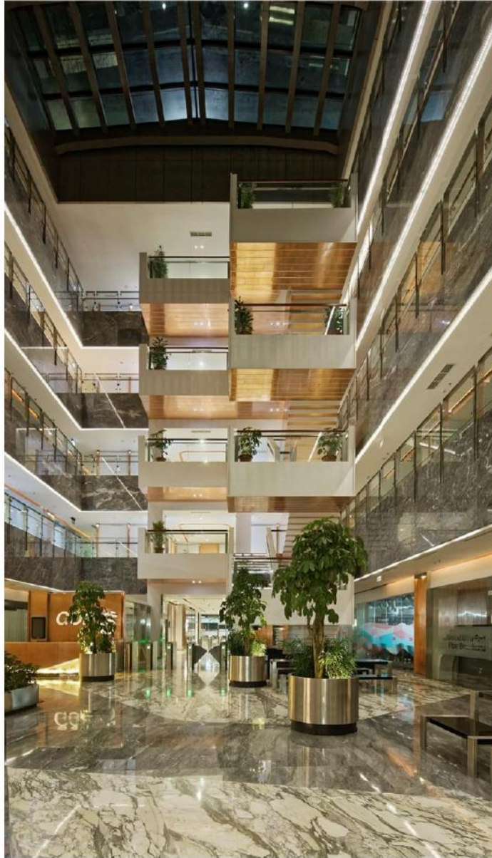
Green Office Park 6 Bumi Serpong Damai Tangerang Indonesia