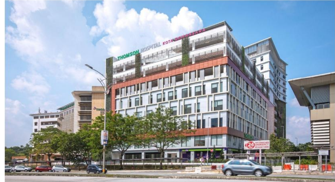
Brunel Medical School Brunel United Kingdom