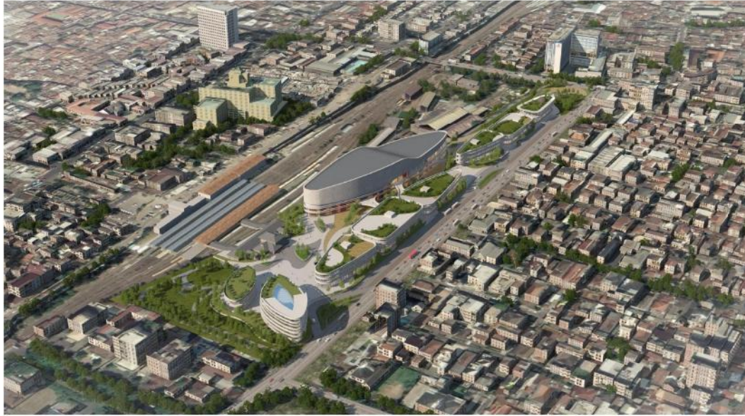
Festival Lake City Selangor Malaysia