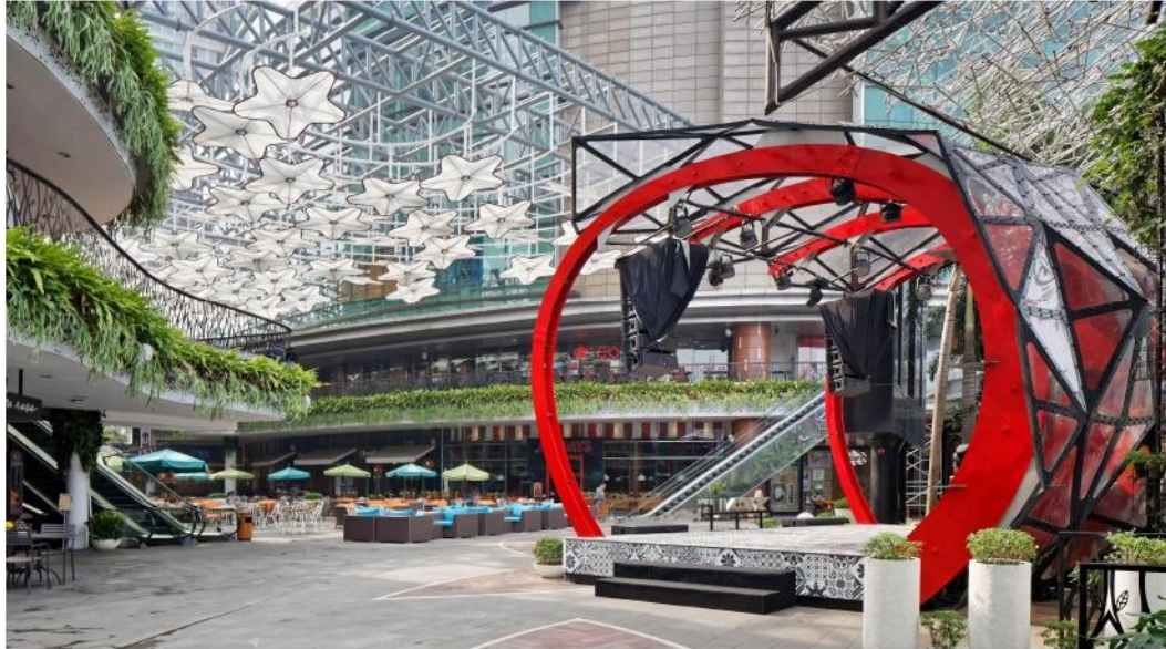
Dorsett Putrajaya Malaysia