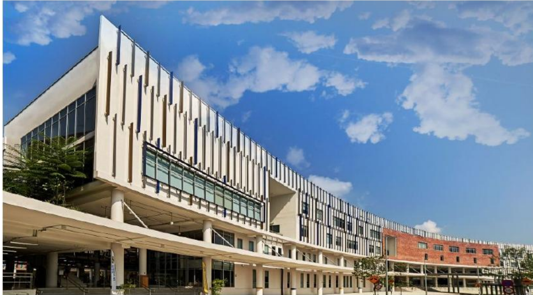
QBig Bumi Serpong Damai Tangerang Indonesia