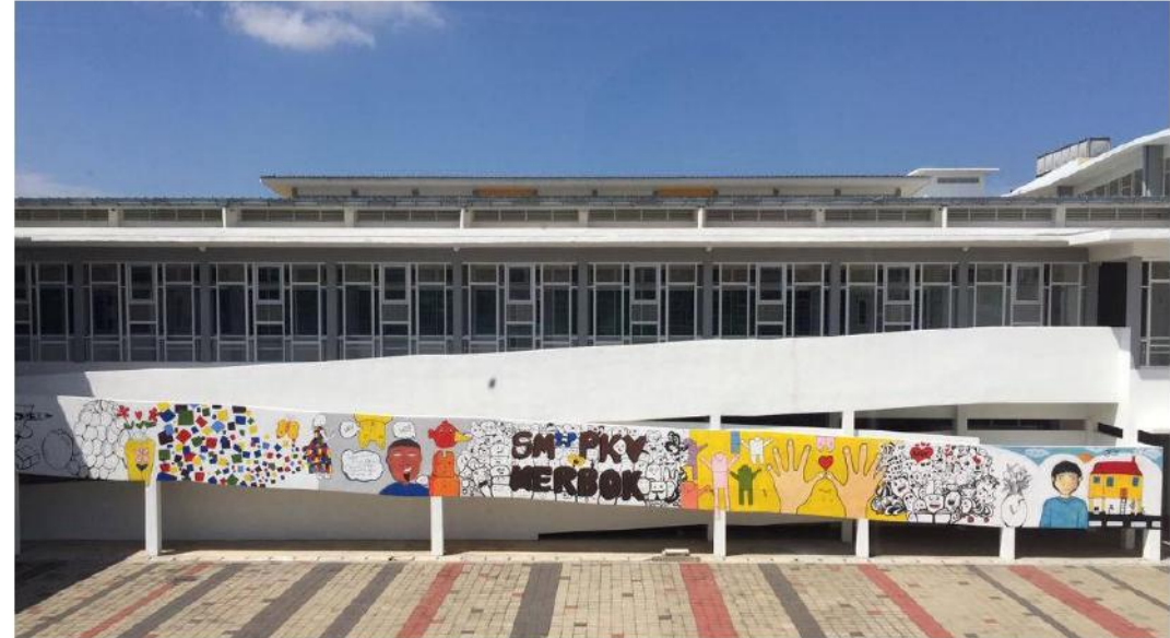
Prasetiya Mulya University Bumi Serpong Damai Tangerang Indonesia