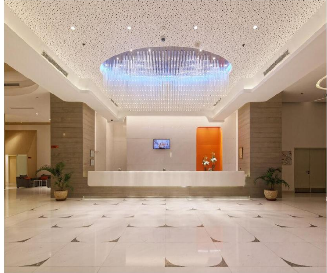
Bintan Resort Riau Indonesia