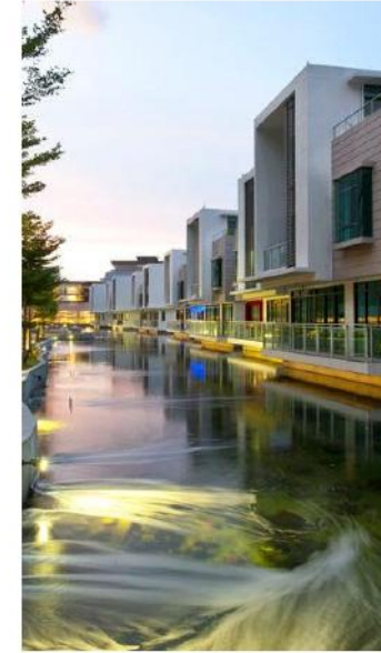
LST Pod Thamrin Residences Jakarta Indonesia