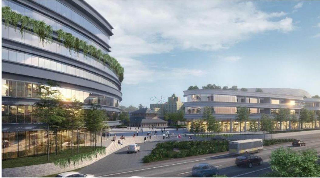
Doha Airport In-flight Catering Doha Qatar