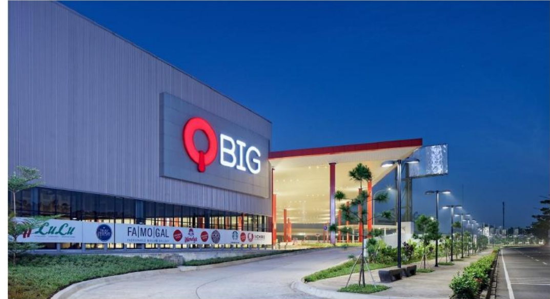
1 Mont Kiara Kuala Lumpur Malaysia