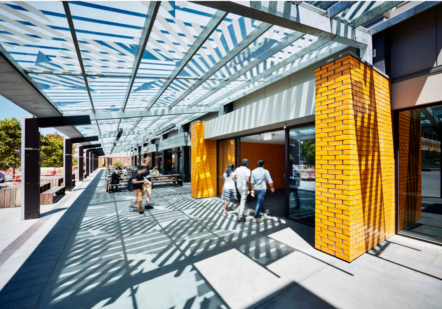
Fitzroy Gasworks Urban Renewal Precinct