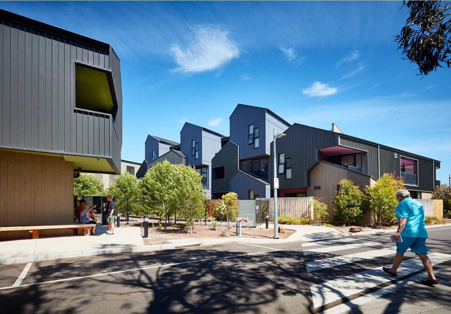
Chapel Street Affordable Housing, St Kilda