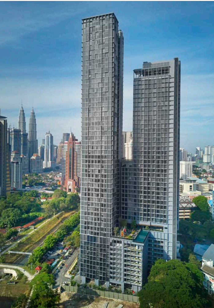
Exsim Expressionz, Kuala Lumpur Bristol Hotel Apartments, Williamstown