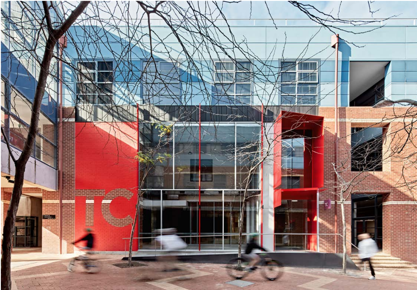
Auburn South Primary School Library and Learning Centre