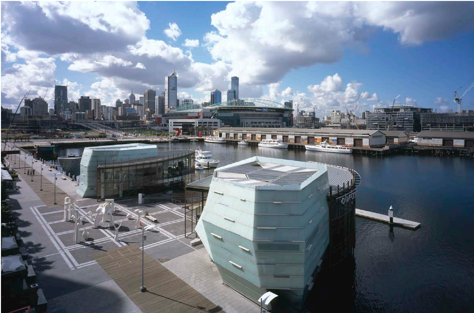
389 Bourke Street, Melbourne