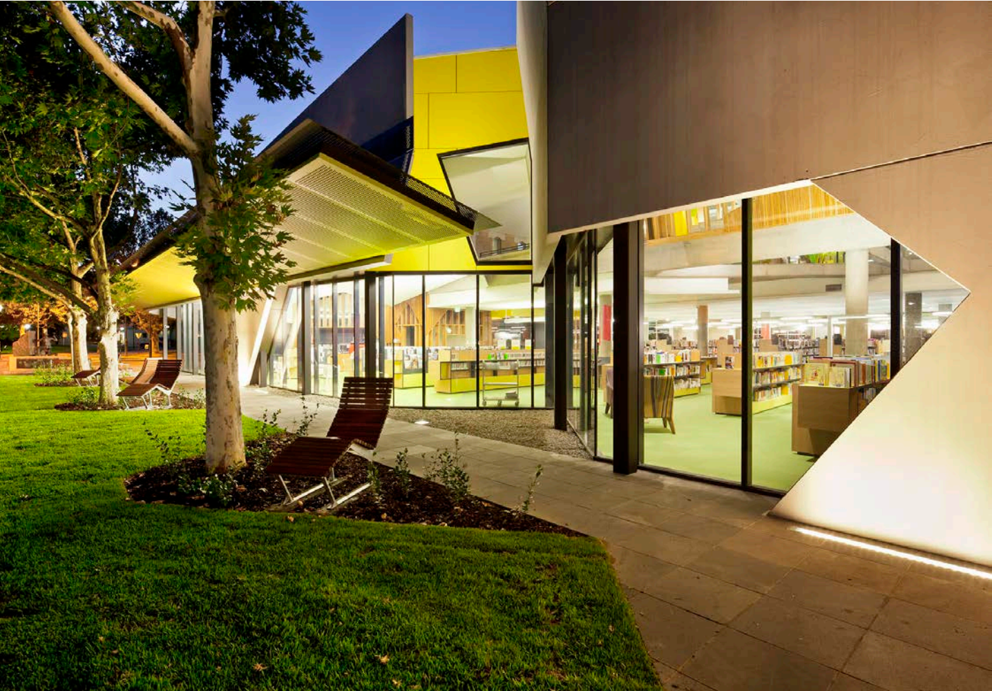
New Generation Bendigo Library