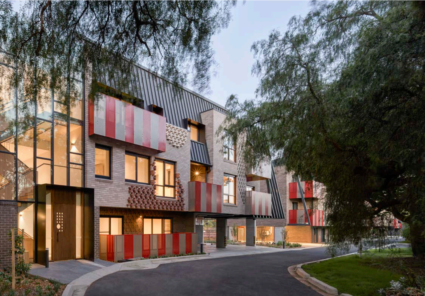
New Epping Affordable Housing, Whittlesea Council