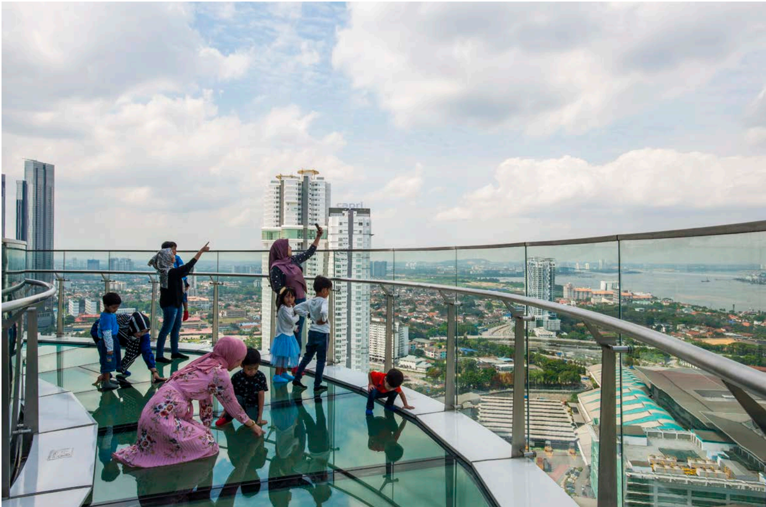
JLand Tower, Johor Bahru