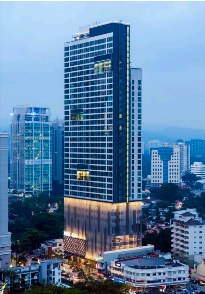
Tribeca, Kuala Lumpur Fitzroy Gasworks Urban Village, Melbourne