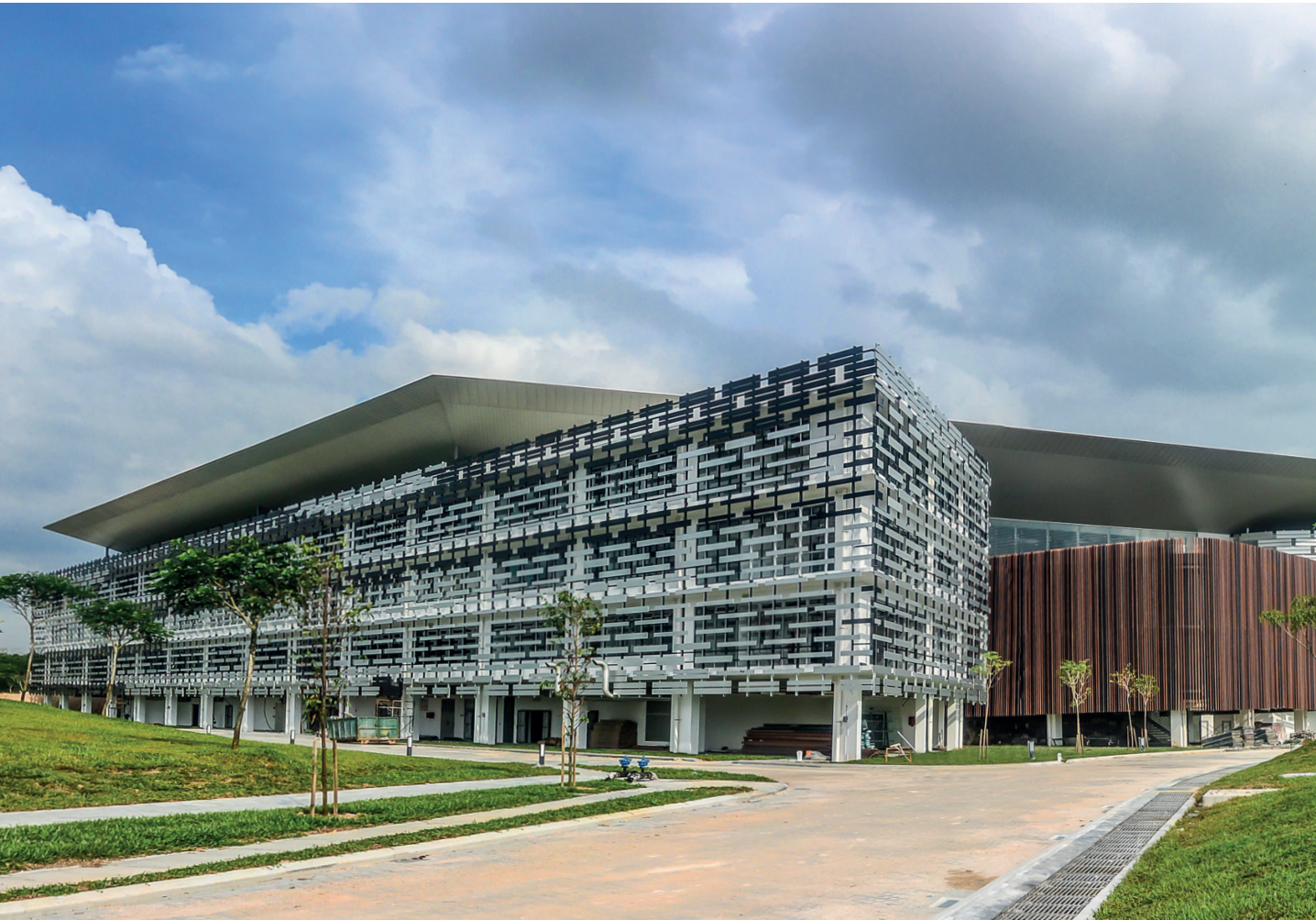
University of Reading, Johor Bahru Desa Park City International School, Kuala Lumpur