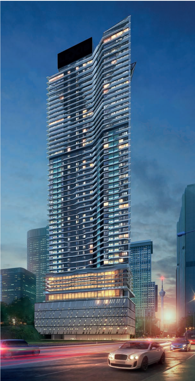
Imperial Lexis, Kuala Lumpur