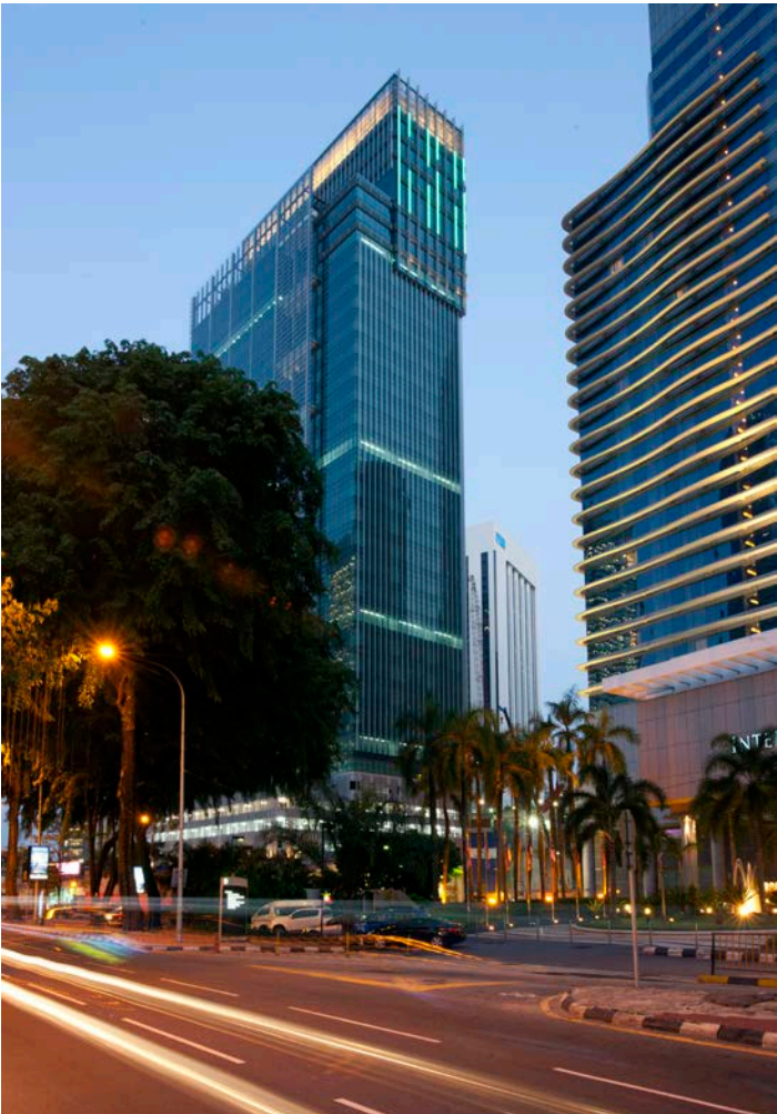
Binjai Tower, Kuala Lumpur Selangor State Development Corporation (PKMS), Selangor, Malaysia