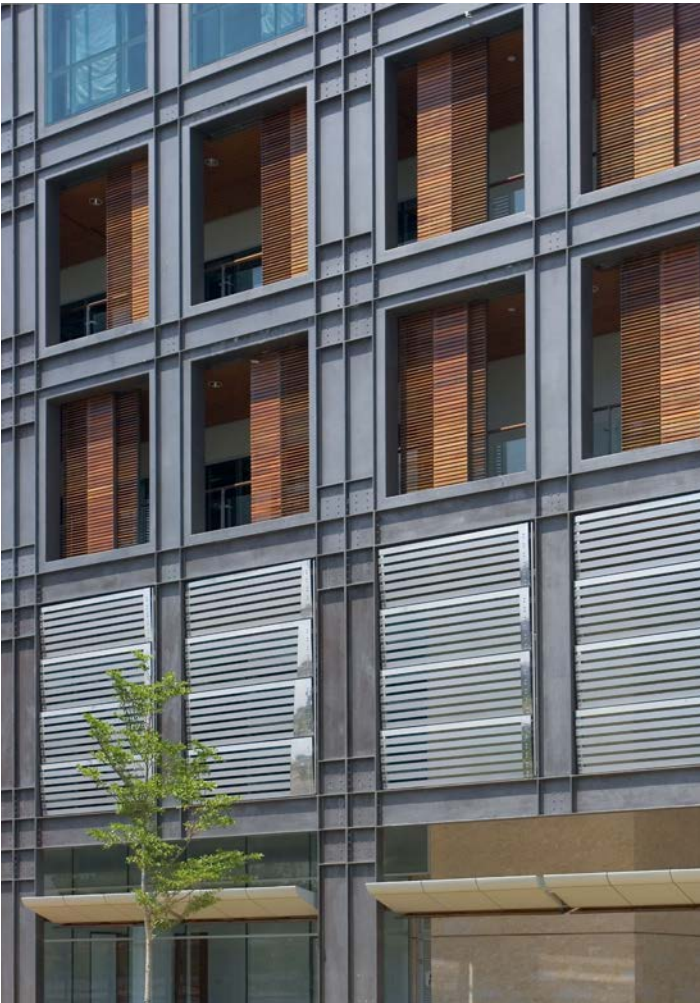
Ministry of Natural Resources and Environment, Putrajaya Desa Park City International School, Kuala Lumpur