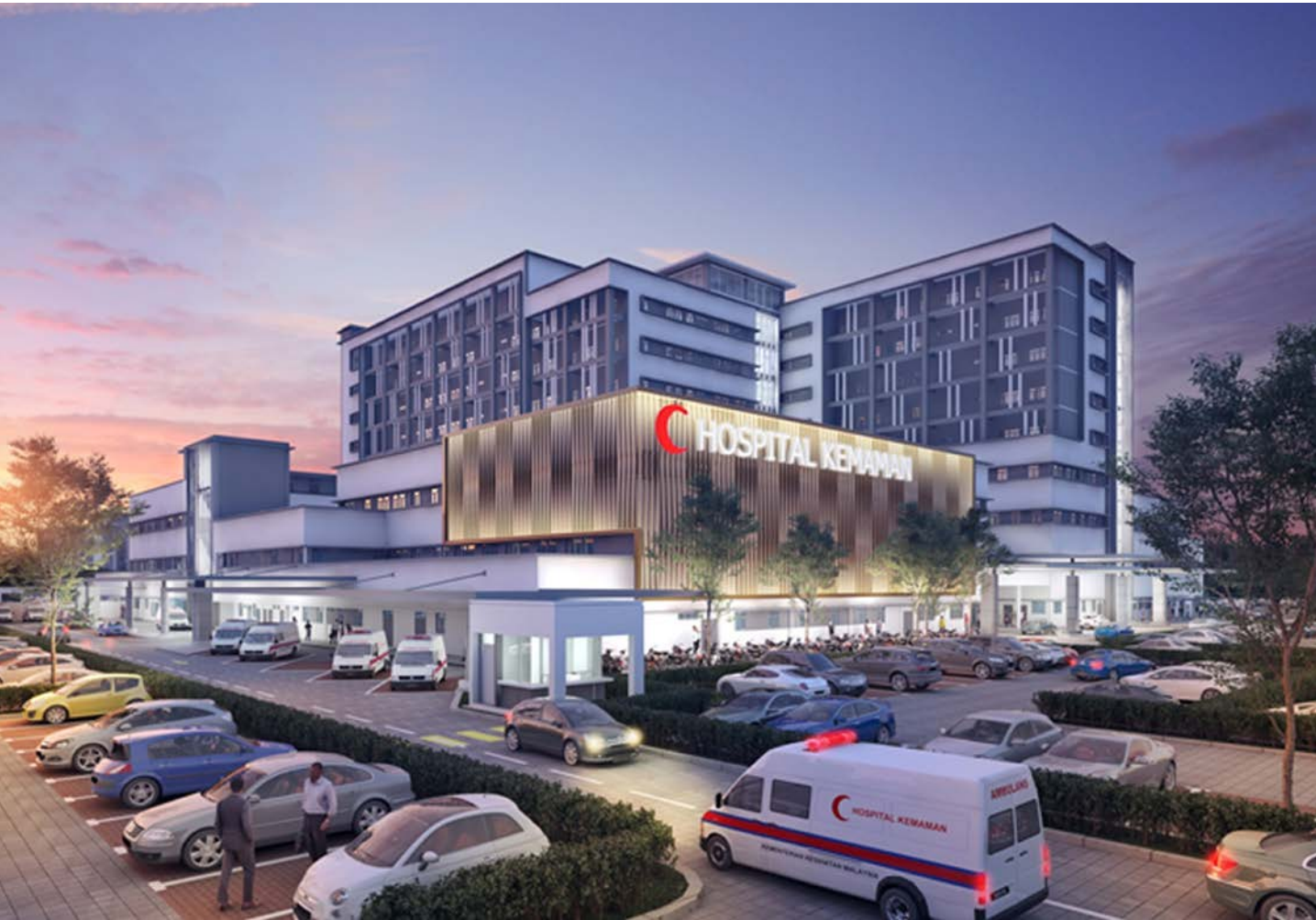
Thomson Medical Centre, Kuala Lumpur