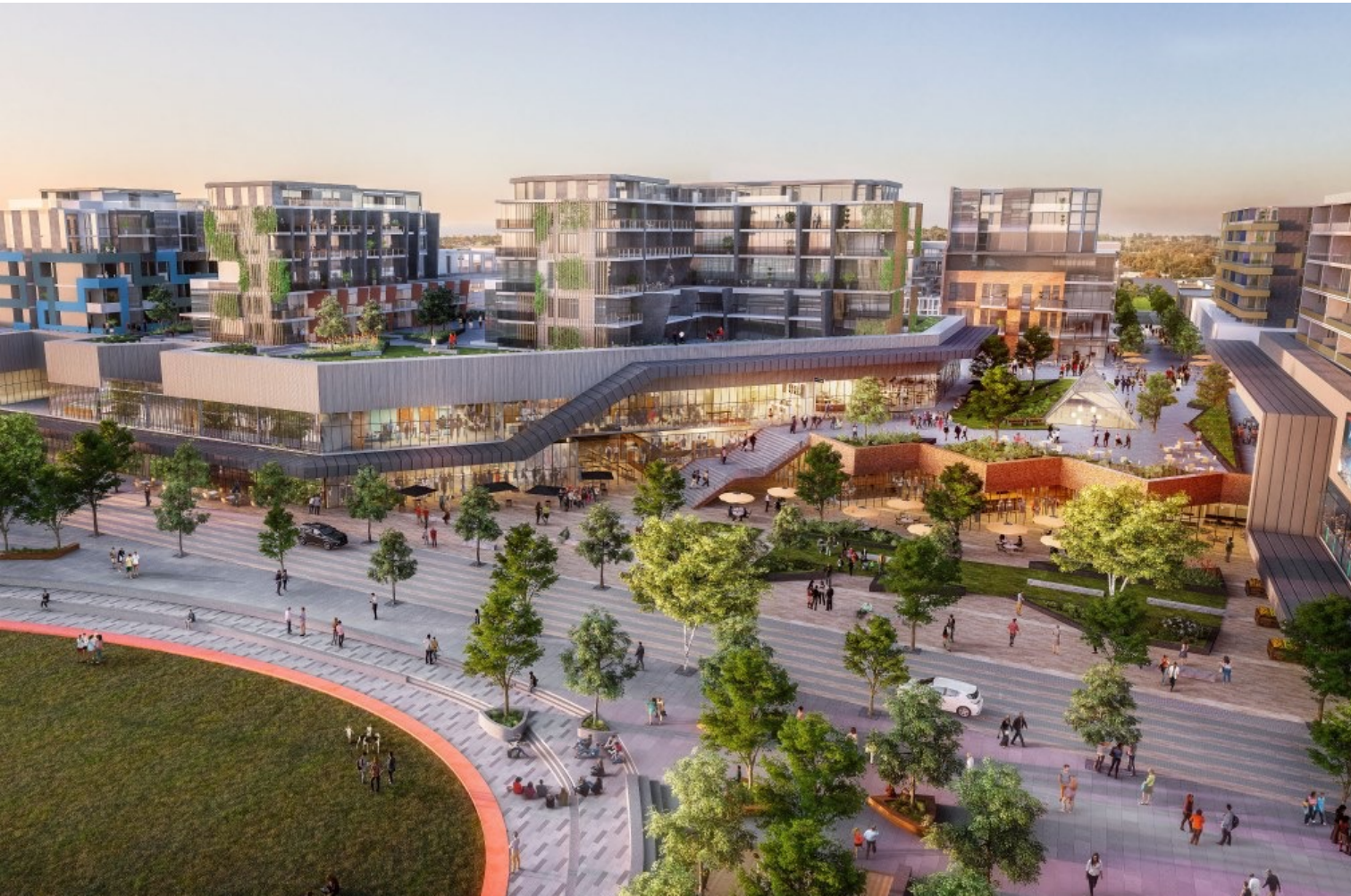
Monash Clayton Eastern Residential Village