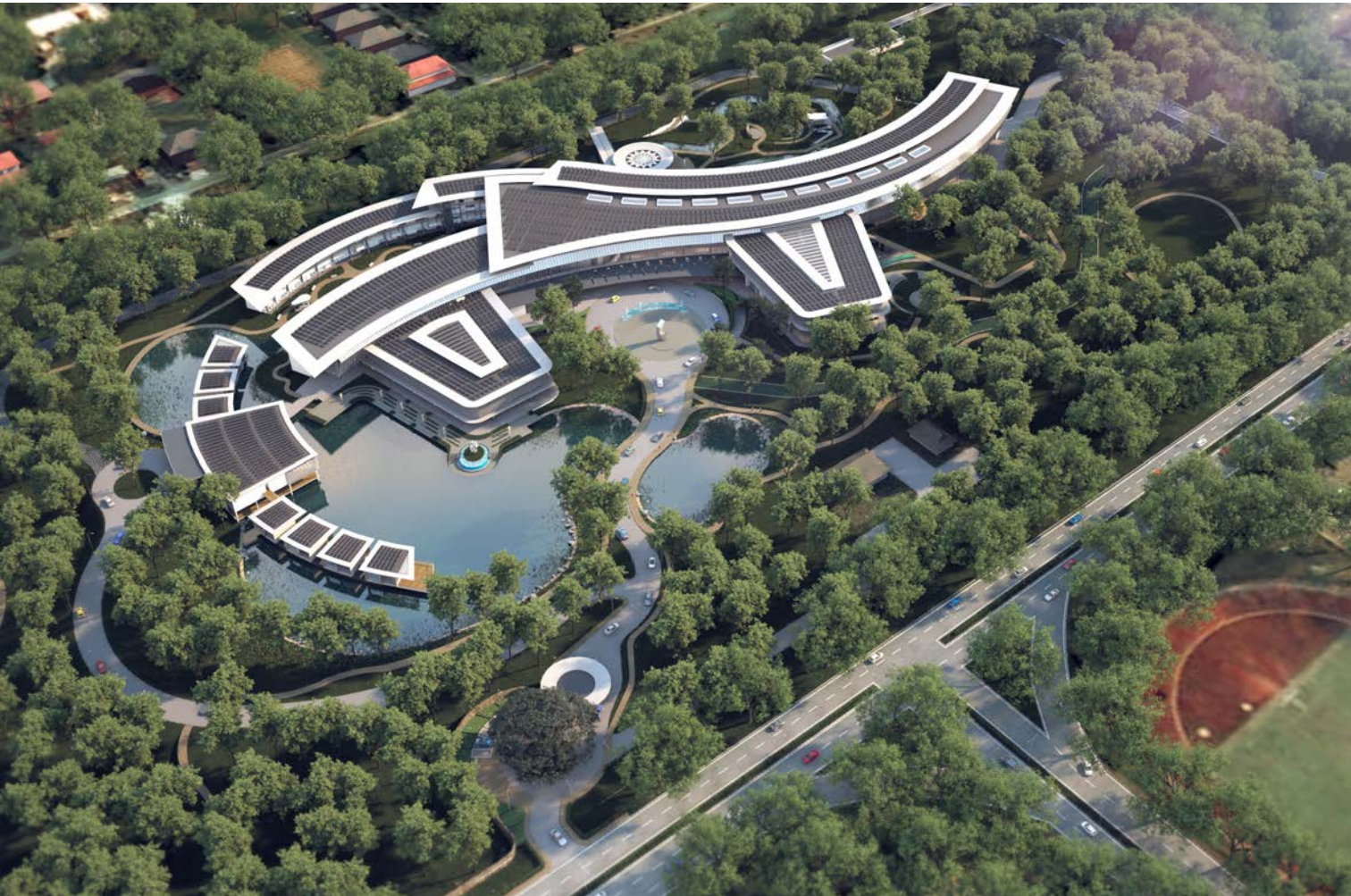
TAC Headquarters, Geelong