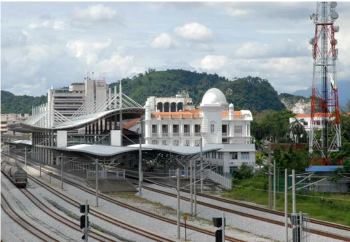
Ipoh Railway Station, Ipoh National Museum (Muzium Negara) Station, Kuala Lumpur Harrow Street Multi-Deck Car Park, Box Hill