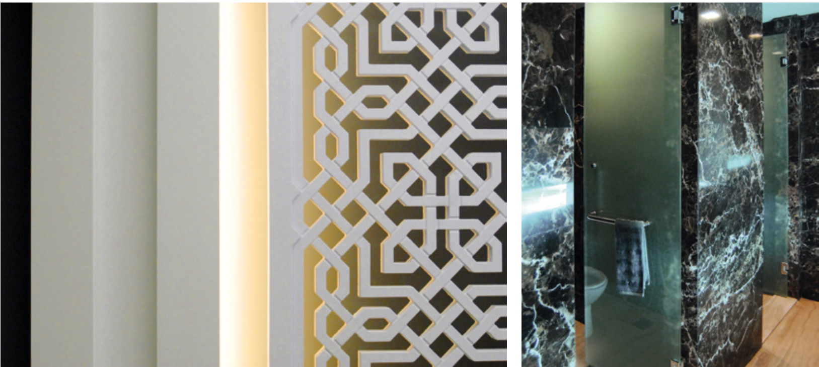
WORLD ISLAMIC ECONOMIC FORUM HEADQUARTERS, WIEF Location : Kuala Lumpur, Malaysia Total Floor Area : 9,000 Sqft