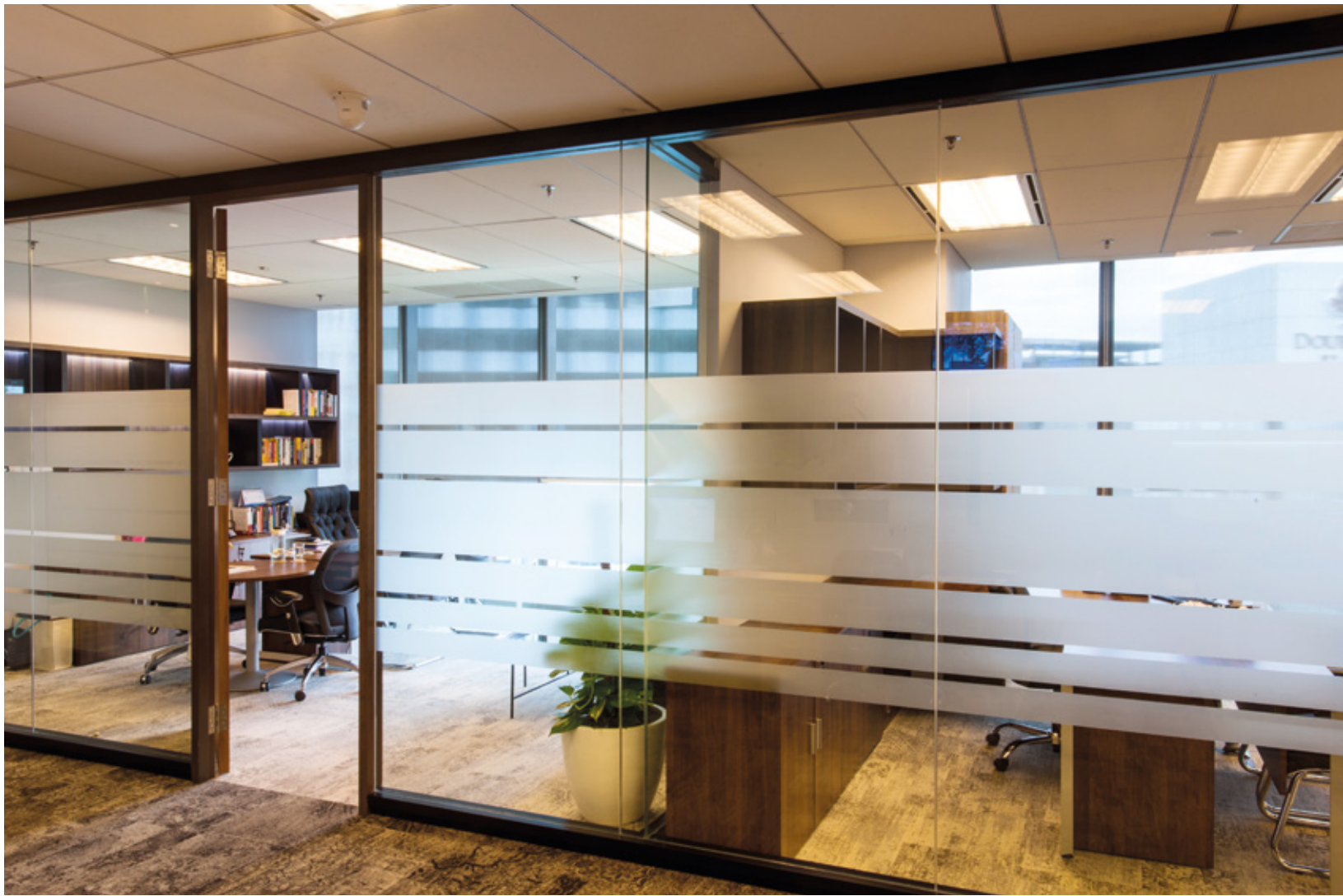
VALUE PARTNERS MALAYSIA HEADQUARTERS, INTEGRA TOWER Location : Kuala Lumpur, Malaysia Total Floor Area : 5,000 Sqft