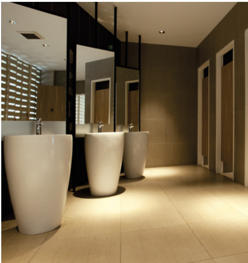
KOTA KINABALU CONVENTION CENTRE (KKCC) OFFICE Location : Sabah, Malaysia Total Floor Area : 1,200 Sqft