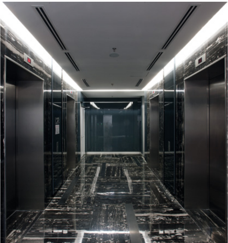
MITRALAND HEADQUARTERS Location : Selangor, Malaysia Total Floor Area : 55,000 Sqft