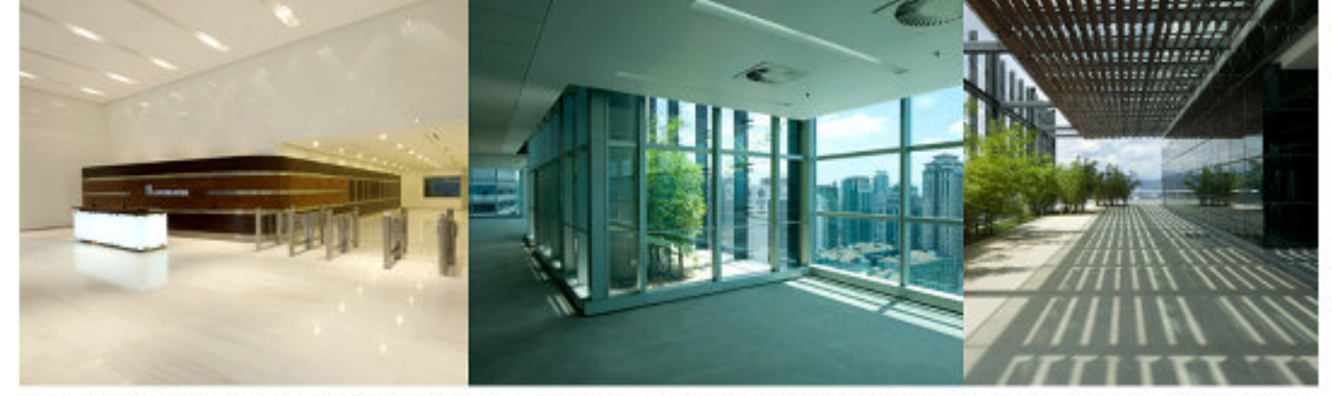
Innovation: Permeable Curtain Wall - A permeable glass screen creates "a breathable skin" in the curtain wall, allowing prevailing northwesterly breezes to infiltrate the sky gardens, whilst buffering the terrace space from winds and heavy monsoon rain. This "urban verandah" allows building users to experience the tropical setting, a contrast to the typical contained office environment.

Where are we FEATURED? The Edge Magazine - A Winner Despite A Slow Primary Market