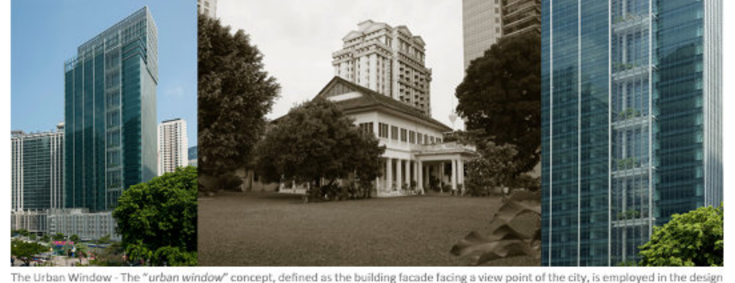
The Urban Window - The "urban window" concept, defined as the building facade facing a view point of the city, is employed in the design of Menara Binjai. The building is crowned by a glass-box "lantern", providing views towards the Petronas Twin Towers.

MENARA BINJAI Renewing for the next generation - Originally the site of a private family home, Menara Binjai is an office tower development conceived to maintain the viability of keeping the plot of land within the family. Timber from the trees in the garden of the old 1920's colonial bungalow was harvested and recycled in the new building as a gesture to commemorate the history of the building.