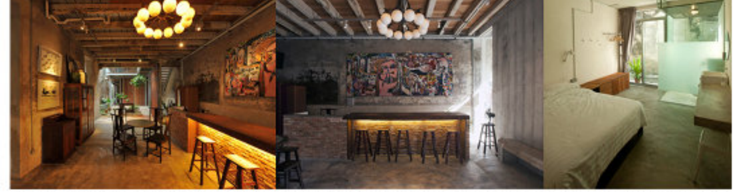
CONNECTING OLD & NEW - Sinkeh means "newcomer" in Hokkien - a commonly used Chinese dialect in Penang. Thus inspired by the idea of "newcomer", a steel pavilion was inserted into the rear of the old shophouse. The courtyard is where the past and present meet, culminating in the main living-social area facing the decades-old party wall, which is retained and bared to conjure an ambience of the past engaging with the new; a contemporary spatial experience that evokes history.

MENARA BINJAI Renewing for the next generation - Originally the site of a private family home, Menara Binjai is an office tower development conceived to maintain the viability of keeping the plot of land within the family. Timber from the trees in the garden of the old 1920's colonial bungalow was harvested and recycled in the new building as a gesture to commemorate the history of the building.