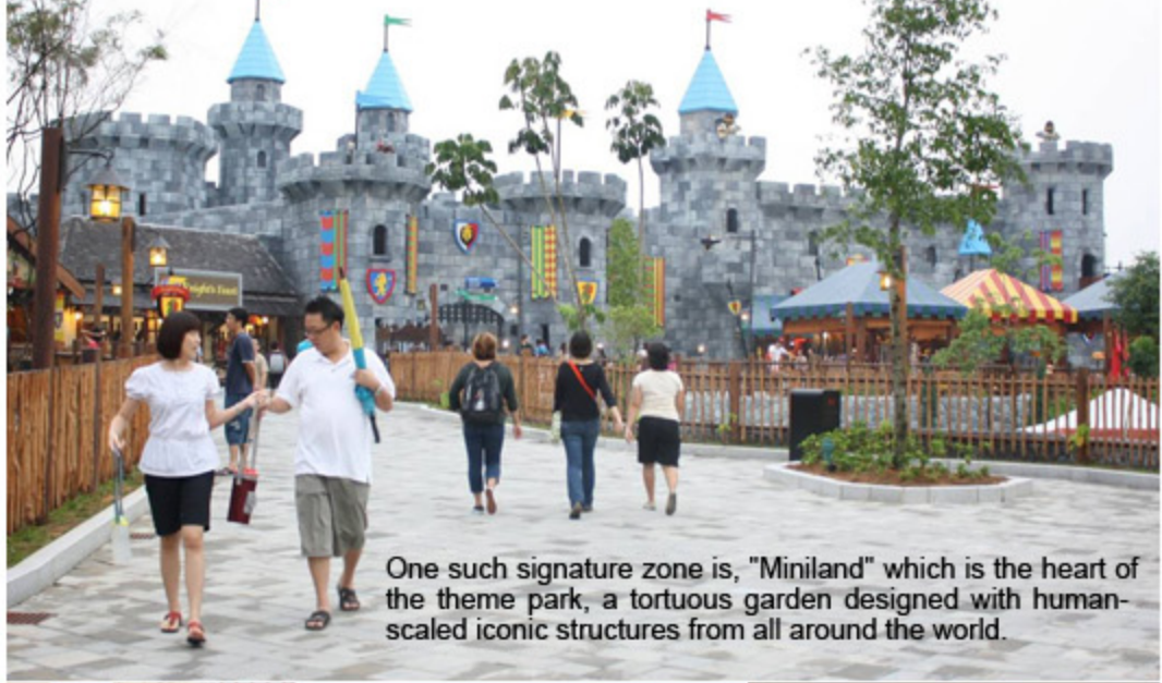
One such signature zone is, "Miniland" which is the heart of the theme park, a tortuous garden designed with human-scaled iconic structures from all around the world.

At the bold entrance the visitor is ushered into a vast playground of theme park rides and recreational zones divided thematically to provide a story and focus to each ride's experience. Families will be immersed in a unique range of 'kid-powered' rides, building challenges, spectacular Lego models, interactive attractions, family-friendly roller-coasters and shows that interact with audiences. This adds up to an mammoth tally of 40 interactive rides, shows and attractions.