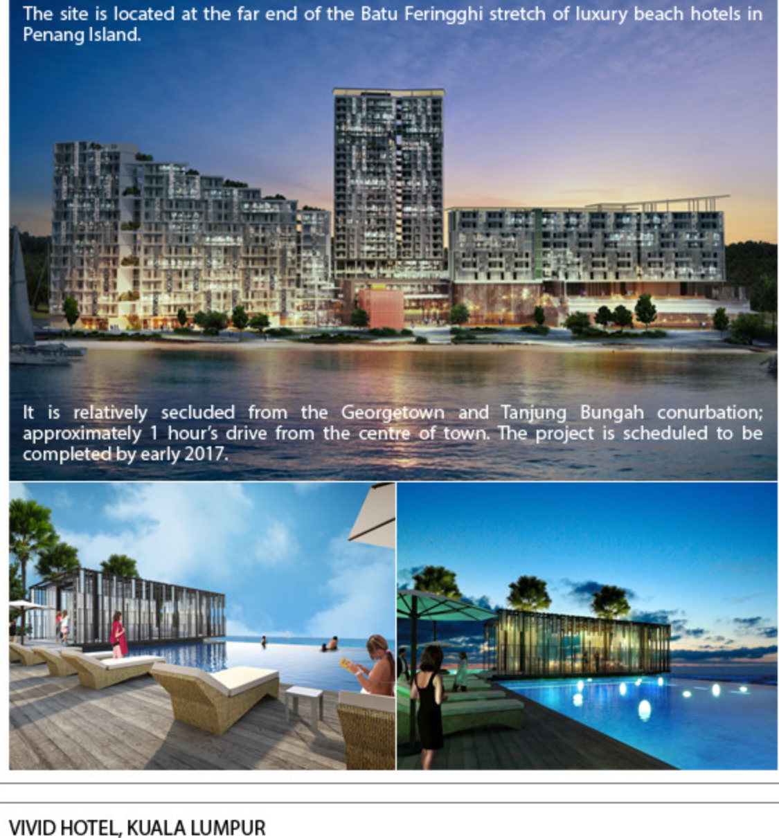
It is relatively secluded from the Georgetown and Tanjung Bungah conurbation; approximately 1 hour's drive from the centre of town. The project is scheduled to be completed by early 2017.

The site is located at the far end of the Batu Feringghi stretch of luxury beach hotels in Penang Island.