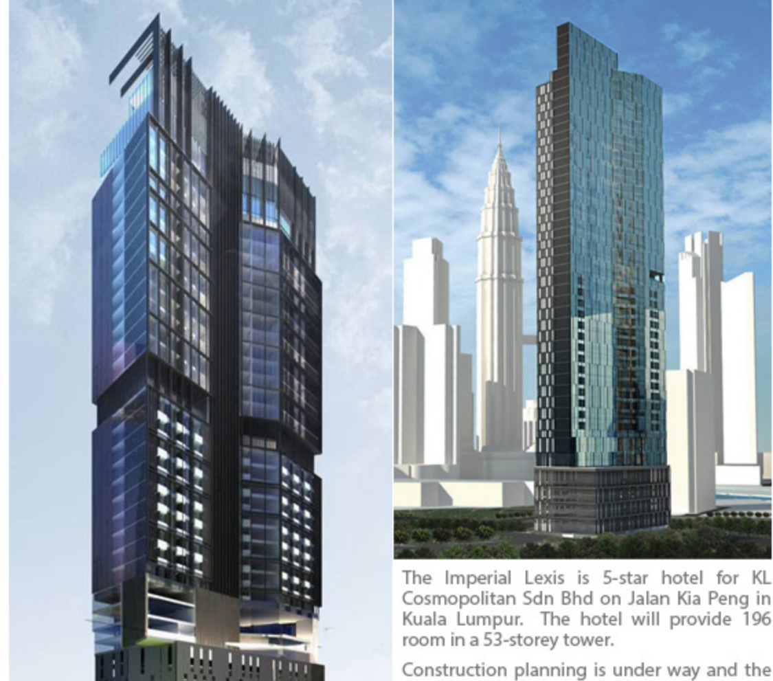
The Imperial Lexis is 5-star hotel for KL Cosmopolitan Sdn Bhd on Jalan Kia Peng in Kuala Lumpur. The hotel will provide 196 rooms in a 53-storey tower. Construction planning is under way and the hotel is expected to open in late-2017.