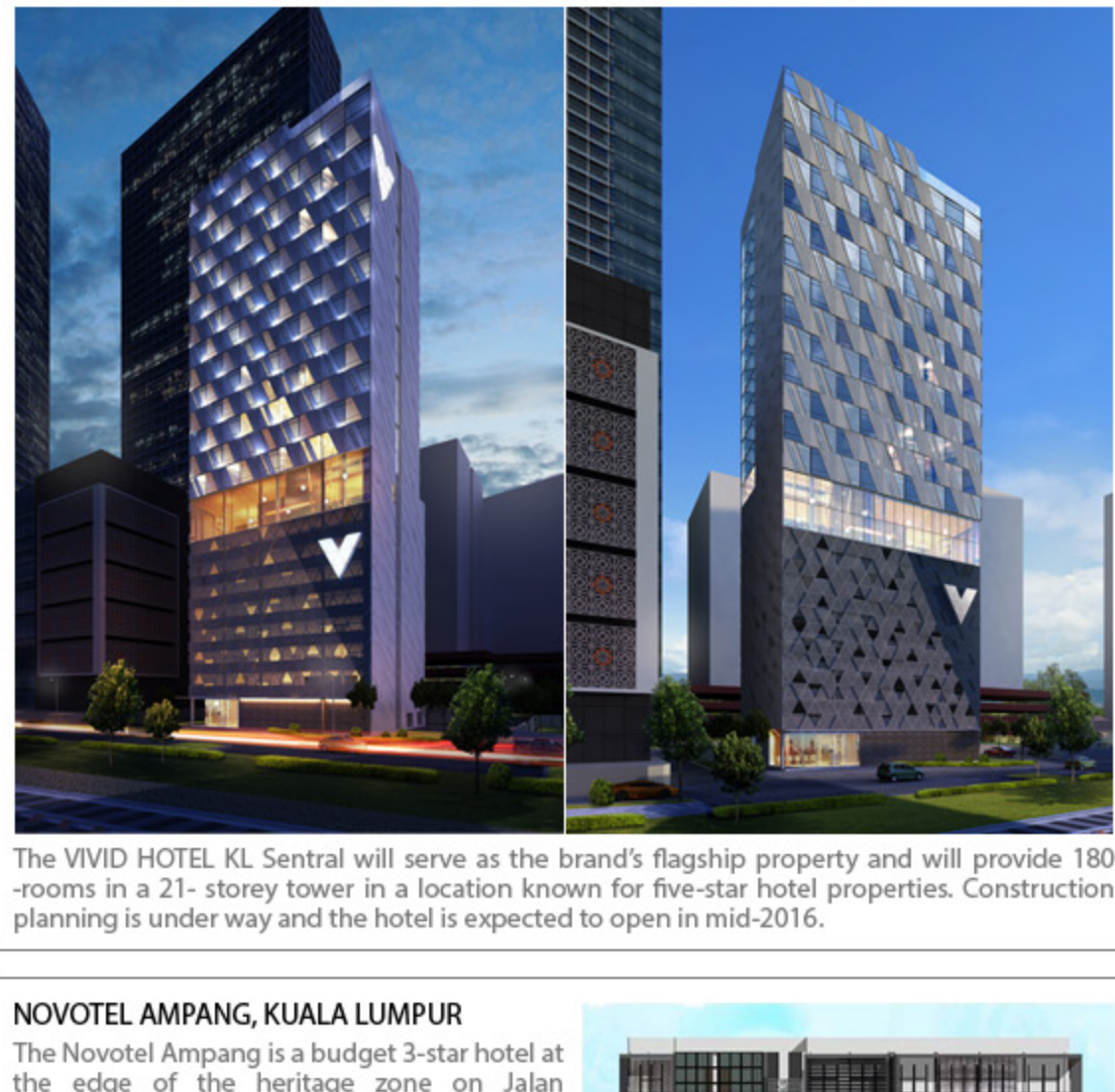
The new VIVID HOTEL for Vanguard Hotels Pte Ltd, is the development of two adjoining bungalow lots which face Jalan Bangsar in KL Sentral adjacent to the global headquarters of Bank Rakyat.