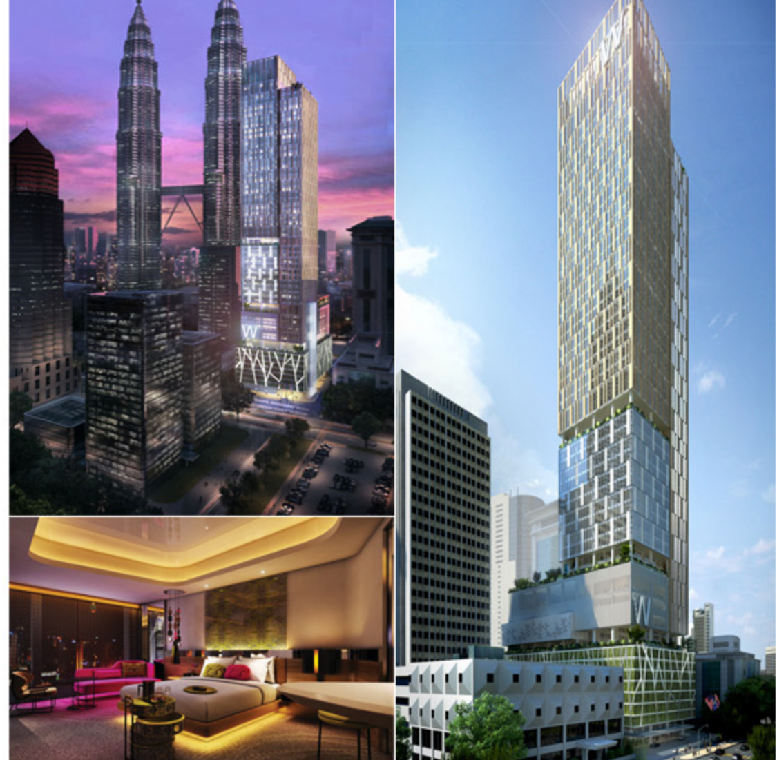
The 60-storey W Hotel development is expected to be completed in 2017.

Making a commentary about the streetwall of Jalan Ampang, the building is recessed from the road frontage, to create a plaza and a more generous drop-off area in front of the building.