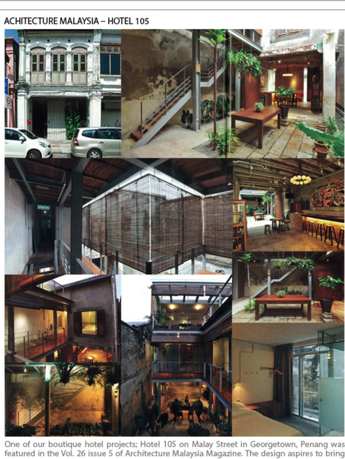
One of our boutique hotel projects; Hotel 105 on Malay Street in Georgetown, Penang was featured in the Vol. 26 issue 5 of Architecture Malaysia Magazine. The design aspires to bring together the past and present by inserting an entirely new 3-storey steel pavilion into the rear of the typical long and narrow shophouse site while preserving the front block with its historical street façade and original timber floor structure. This project was open to the public in August 2013.